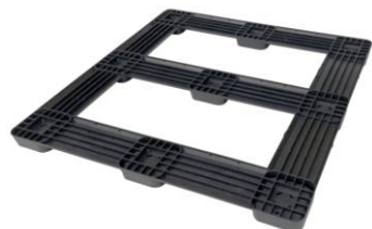
5 runners kit