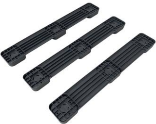
3 runners kit