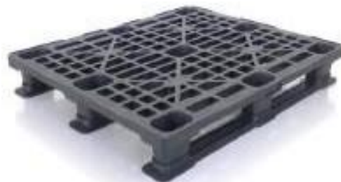
3 runners kit