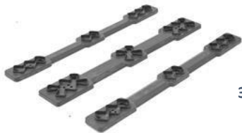
3 runners kit